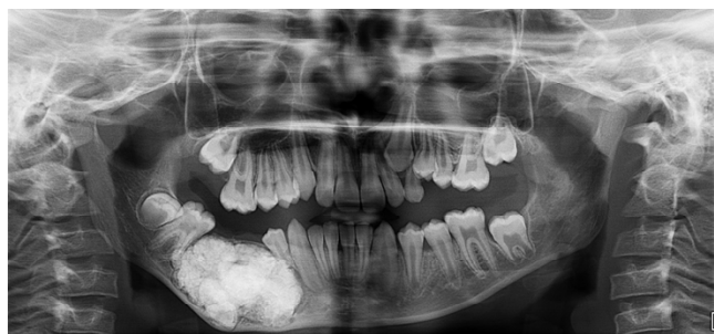
Figure 2: Extra Oral Radiograph