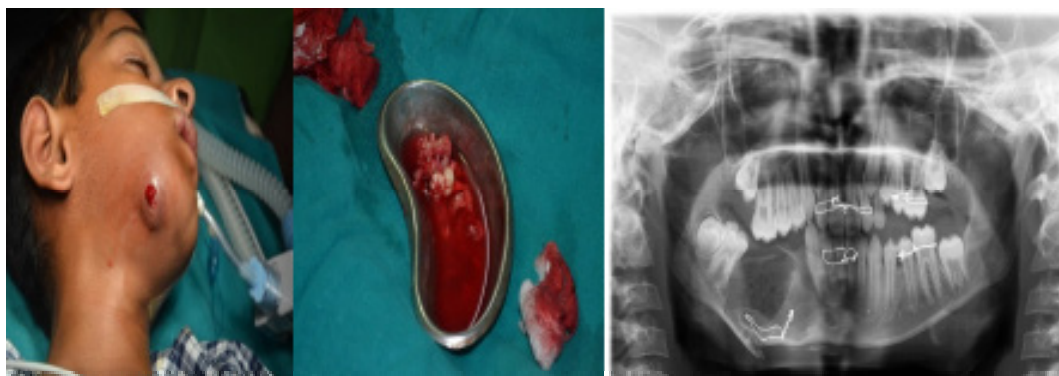
Figure 5: Intra Operative Postoperative