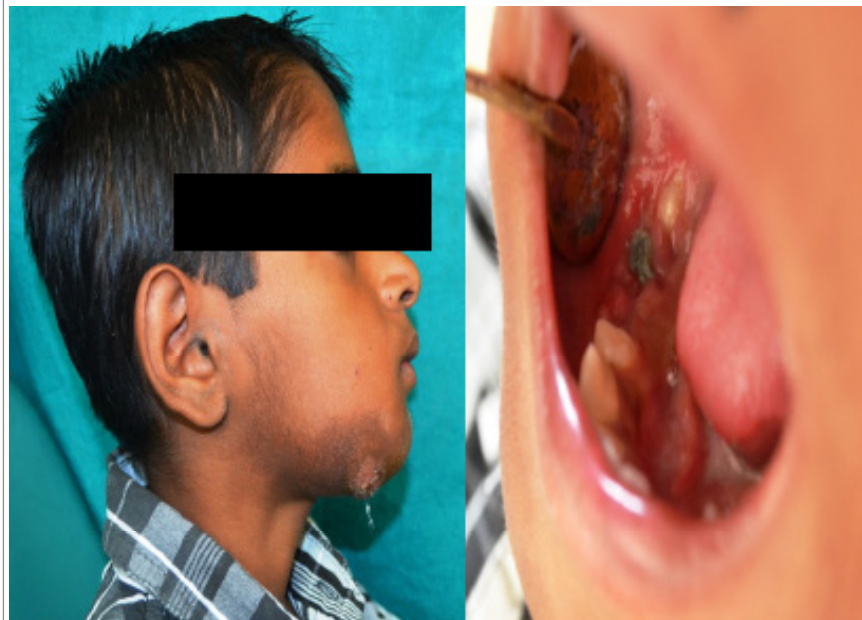
Figure1: swelling on right side of lower 1/3rd of face